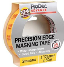
24MM X 50M PRECISION EDGE MASKING TAPE PRODUCT CODE: ATMT001