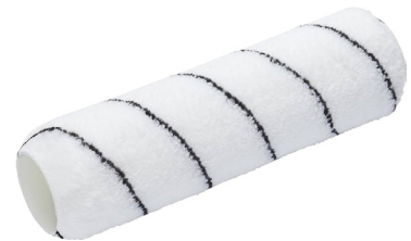
9" X 1.75" MEDIUM PILE MICROFIBRE ROLLER PRODUCT CODE: ARRE003