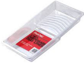
PLASTIC LINERS FOR 4" TRAYS 5PK PRODUCT CODE: MRTLINER