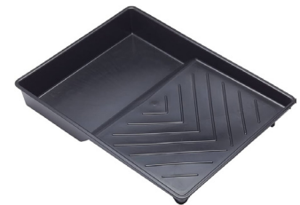
9" BLACK PLASTIC PAINT TRAY PRODUCT CODE: 9PT