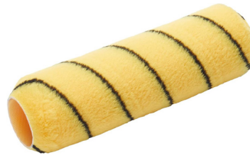
9" X 1.75" TIGER MEDIUM PILE WOVEN ROLLER PRODUCT CODE: PRRE003