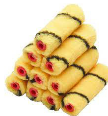
4" TIGER MEDIUM PILE MINI ROLLER 10PK PRODUCT CODE: PRRE040