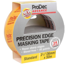
36MM X 50M PRECISION EDGE MASKING TAPE PRODUCT CODE: ATMT002