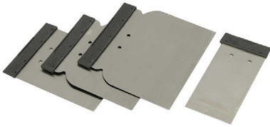
FILLING BLADES (QTY 4) PRODUCT CODE: PFB4P