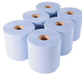
EMBOSSED CENTREFEED BLUE ROLLS PRODUCT CODE: BCF1814E2