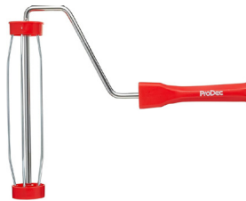
9" X 1.75" PUSH FIT PLASTIC HANDLE CAGE FRAME PRODUCT CODE: PRFR005