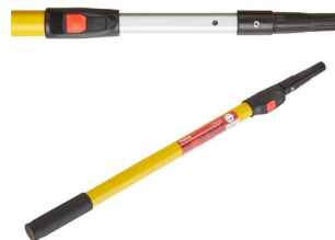
2' - 4' BUTTON LOCK EXTENSION POLE PRODUCT CODE: PREX003