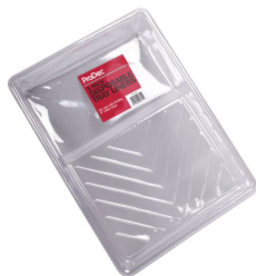
9" PLASTIC LINERS (QTY 5) PRODUCT CODE: 9PTLINER