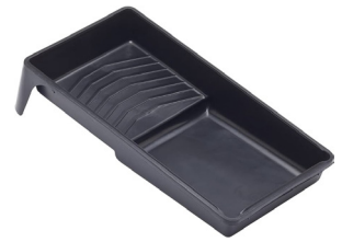
PLASTIC MINI ROLLER TRAY PRODUCT CODE: MRT