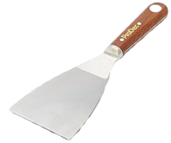
3" DURAGRIP FILLING KNIFE PRODUCT CODE: DGFK3