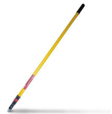
4' - 8' BUTTON LOCK EXTENSION POLE PRODUCT CODE: PREX004