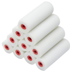
4" HD FOAM MINI ROLLERS 10PK PRODUCT CODE: PRRE036