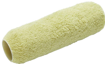
9" X 1.75" HEAVY DUTY WOVEN ROLLER PRODUCT CODE: PRRE005