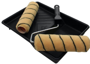
9" X 1.75" TIGER MEDIUM PILE ROLLER, FRAME & TRAY KIT PRODUCT CODE: PRRT007