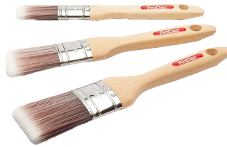
PREMIER OVAL SYNTHETIC BRUSH SET (QTY 3) PRODUCT CODE: PBPT055