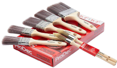
PREMIER FLAT SYNTHETIC BRUSH SET (QTY 6) PRODUCT CODE: PBPT049