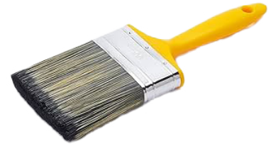
4" FLAT MASONRY BRUSH PRODUCT CODE: PR4GY