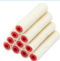
4" GLOSS PILE MINI ROLLER 10PK PRODUCT CODE: PRRE038