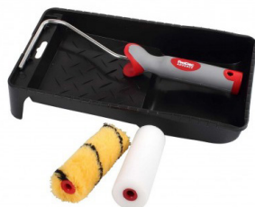
4" TWIN HEAD MINI ROLLER, FRAME & TRAY KIT PRODUCT CODE: PRRT015