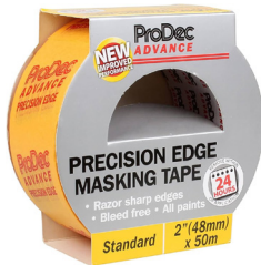
48MM X 50M PRECISION EDGE MASKING TAPE PRODUCT CODE: ATMT003