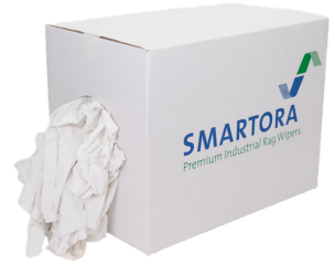
WHITE T-SHIRT WIPERS PRODUCT CODE: WCH10